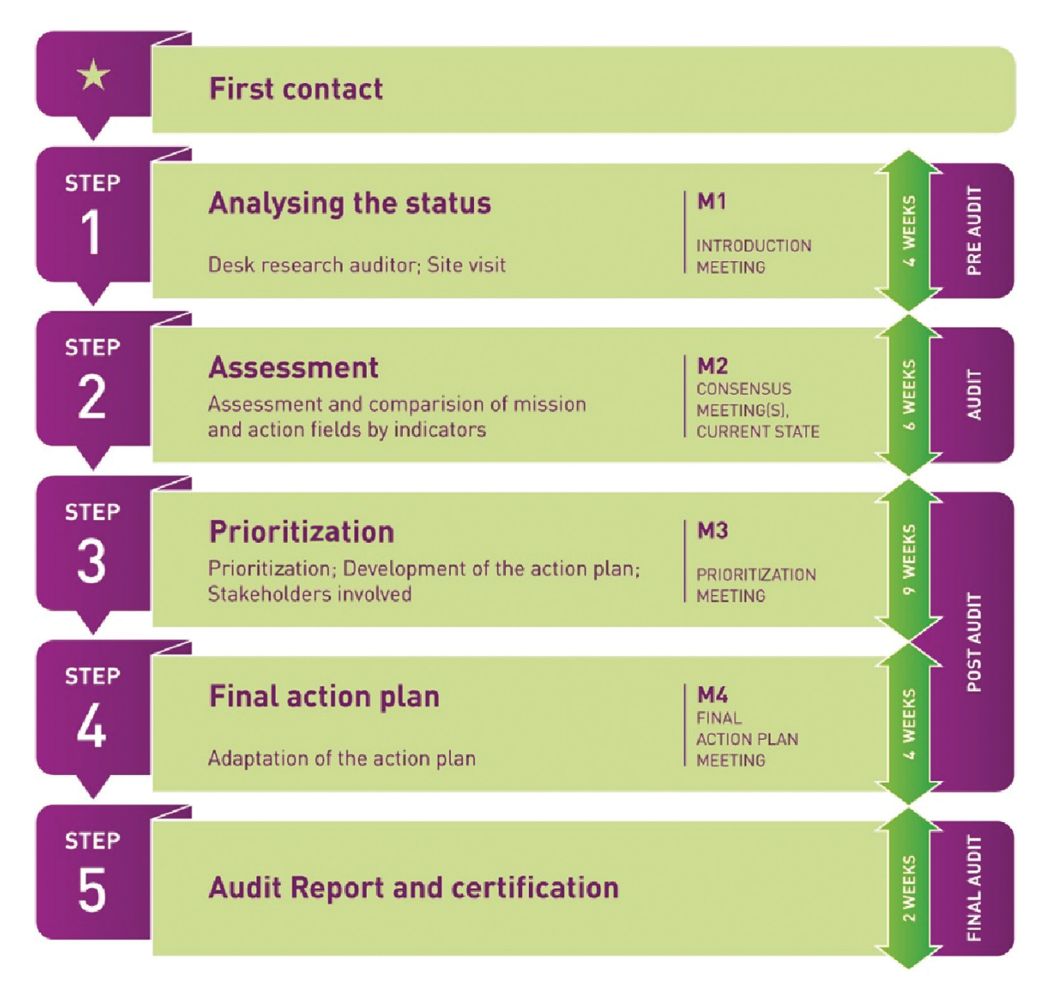
Figure 3: ADVANCE audit scheme (Source: ADVANCE [3]).

A meeting between two certified auditors and the town representatives was organized. The auditors clearly explained their role as facilitators of the audit process and described the necessary capabilities and resources that were required to compose the ADVANCE working group. Special emphasis was put on the involvement of relevant stakeholders. The auditors collected context indicators, researched the relevant city documents and carried out a site visit to the city, which helped to determine the baseline situation of the city.