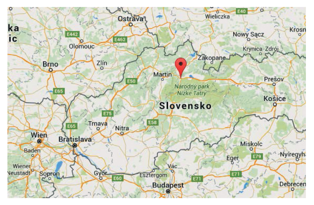
Figure 2: Location of Ružomberok.

Ružomberok started to develop its SUMP in September 2015 and the work will continue during the first half of 2016. The first step was independent validation of its urban mobility performance and sustainability by ADVANCE audit. The aim of the audit is to assess and improve the quality of the mobility planning and policy in the city, as well as to analyse, systemize and improve the whole process of the development of the SUMP. These 'process' elements are analysed by the Mission Fields; the implementation of measures and actions in the city is analysed by the Action Fields. The process follows five steps as represented in Fig. 3.