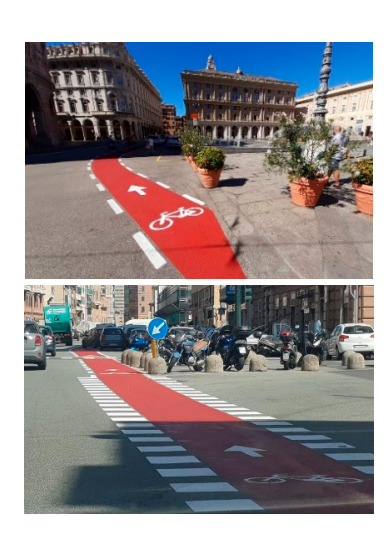
Figure 1. Emergency cycle paths in Genoa.

In Italy, as in various European countries, at the regulatory level in July 2020, the Relaunch Decree was issued (Law of 17 July 2020, n 77, which entered into force on 19 July 2020) that introduced measures to encourage sustainable mobility. It has introduced funds for the design and construction of cyclostations and interventions concerning the safety of city cycling as well as incentives for the purchase of low-emission vehicles [43,44].