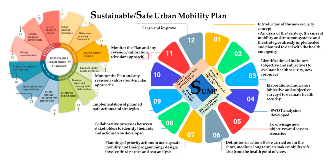
Figure 2. The 12 Steps of Sustainable Urban Mobility Plan (SUMP) and the new circular approach of the Sustainable and Safe Urban Mobility Plan.

There are four phases that characterize the development of the Plan [68] (Figure 2):