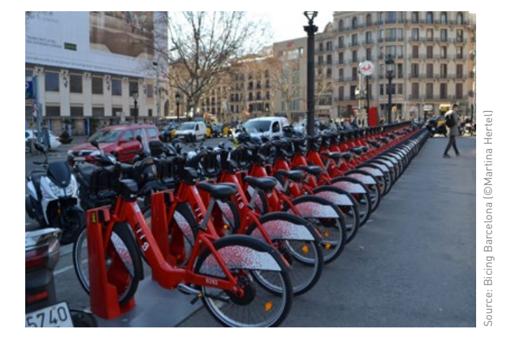
read more (http://www.bikeoff.org/dr_PDF/schemes_public_bicing.pdf)