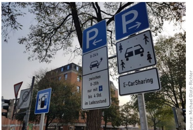
Figure 7: Example for car sharing signage and parking space in Munich (Germany)