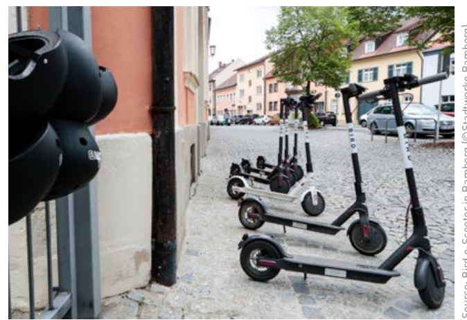
Figure 5: The different types of e-Scooter

At present, there are only few empirical studies on e-Scooter sharing systems available. Paris has gathered quite some experience and is going to regulate the operation much stricter. The city of Madrid has declared itself the pioneer city for electric scooters in Europe. It reduces the area for cars to make room for e-Scooter. Nevertheless, there are big problems. In the last autumn, the city temporarily withdrew the licenses from the rental scooter providers because the users did not adhere to the pavement ban and had caused many accidents. Now