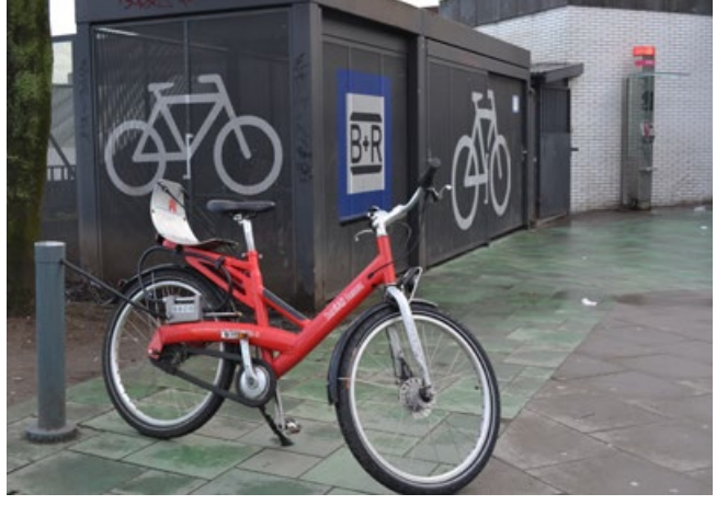
read more (https://www.bikecitizens.net/ hamburg-promoting-cycling-bike-benefit/)