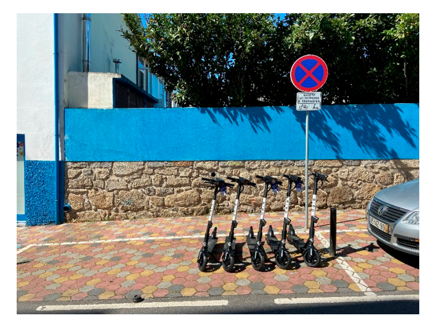
Figure 1. E-scooter parking spot converted from a car parking spot in Braga.

Francisco Sanches Street, Janes Street, S. Marcos Street, Liberdade Avenue, and Dr. Gonçalo Sampaio Street. The map in Figure 2 covers the city of Braga with the "red zones" printed in "red" and the 22 e-scooter parking sport in green.