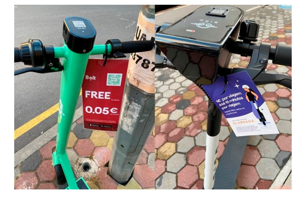
Figure 3. Bolt and Bird price reduction to increase e-scooter usage.

Besides, to increase usage of this mode of transport in the city companies started offering reductions in pricing. Bolt offered the service with a free e-scooter unlock and only 0.05 \in per minute traveled (Figure 3). Bird, on the other hand, started providing 15-min trips for only 1 \in (Figure 3), along with the offering of some trip packs to be used for one month or 90 days with price reduction.